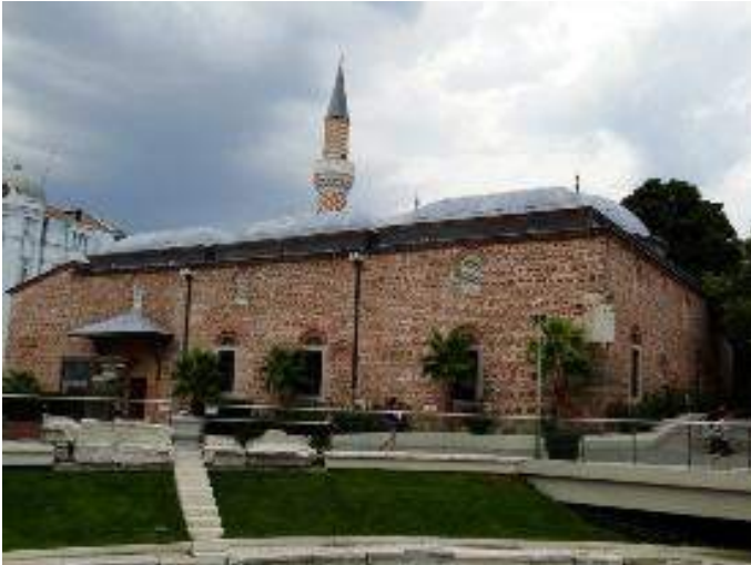
Plovdiv Roman Stadium

Its original name is the Muradiye mosque because it is believed to have been built during Sultan Murad's time. The building is remarkable in itself, it is not only as a religious but also as a cultural and historical temple.