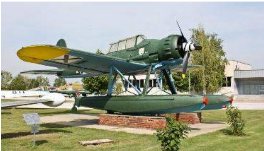
Plovdiv Aviation Museum